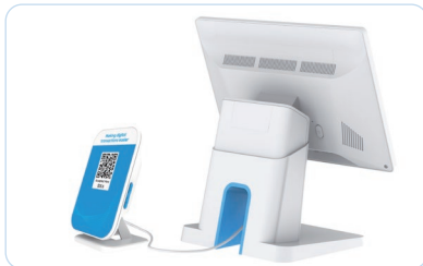
External Cash Register